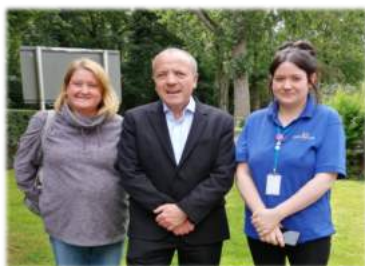
Mike Kane MP, and supporters of the Carers Together Group